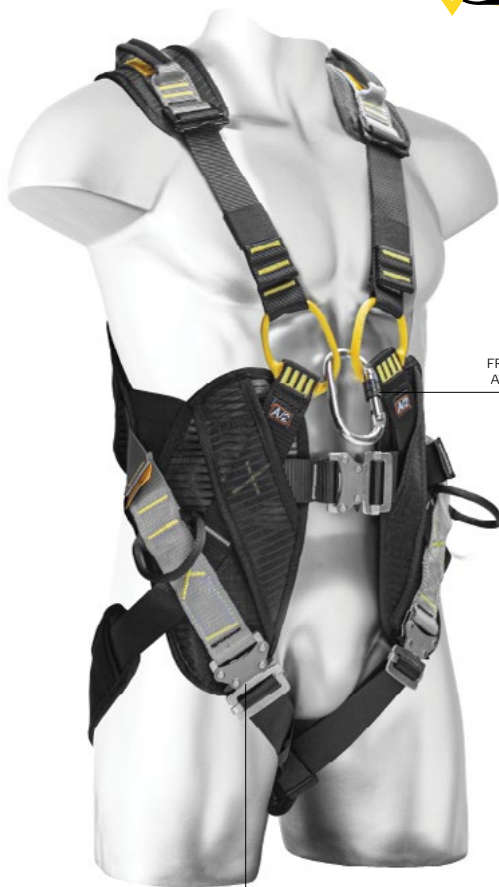
FRONT FALL ARREST ATTACHMENT POINT